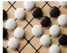
Awesome Science Club